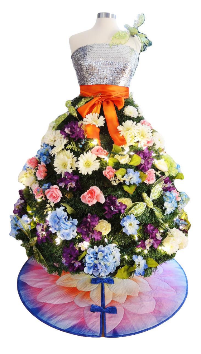
Festive for your special event!!!

Traditional Colors non-traditional shape!